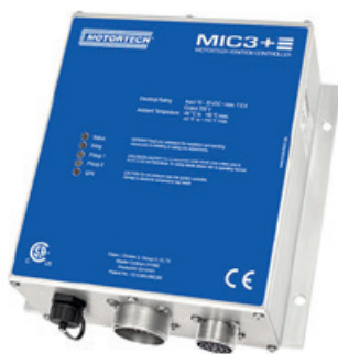
MIC3+ MOTORTECH IGNITION CONTROLLER

With the new sealing concept, even greater tightness is achieved. With the introduction of the new seals, the ignition control units mentioned will then meet the requirements of protection class IP69.