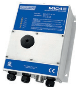
MIC4 MOTORTECH IGNITION CONTROLLER