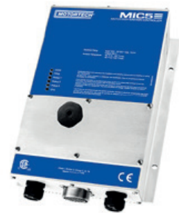
MIC5 MOTORTECH IGNITION CONTROLLER

MOTORTECH GmbH Hogrevestr. 21-23 29223 Celle, Germany Phone: +49 5141 - 93 99 0 Fax: +49 5141 - 93 99 99 www.motortech.de motortech@motortech.de