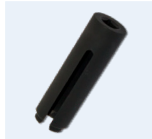
Spark Plug Socket P/N 07.99.022-6-2