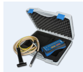
SparkView High Voltage Indicator P/N 06.50.099-100