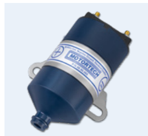
Ignition Coil P/N 06.50.055