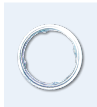
Spark plug gaskets, M18 P/N 02.85.016-100