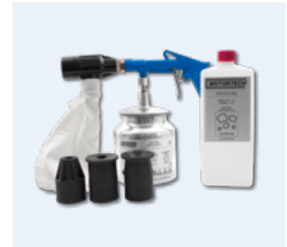
Spark Plug Cleaning Kit P/N 44.01.023